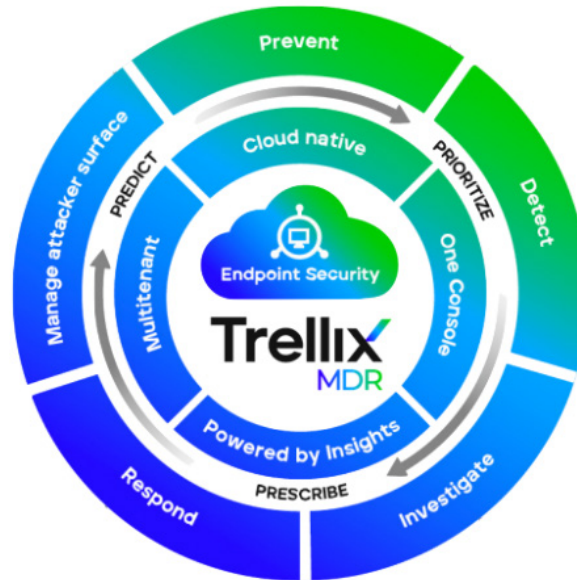
Figure 1: Trellix MDR unites the power of Trellix Endpoint Security, Trellix EDR, Trellix Insights, and Trellix ePolicy Orchestrator (ePO) with elite expertise, GenAI-powered detection, and 24/7 management.

Trellix Endpoint Security covers more operating systems and OS versions than any other solution, allowing Trellix MDR services to provide broad visibility of your endpoints.