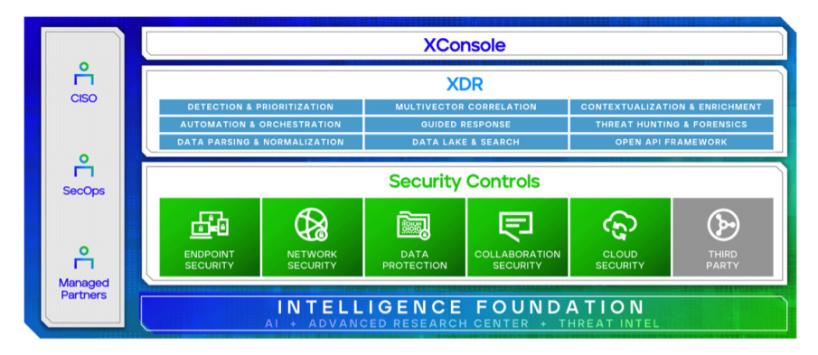
Figure 2. The Trellix Platform.

Trellix's revolutionary threat detection and response is delivered by the <u>Trellix Platform</u>.